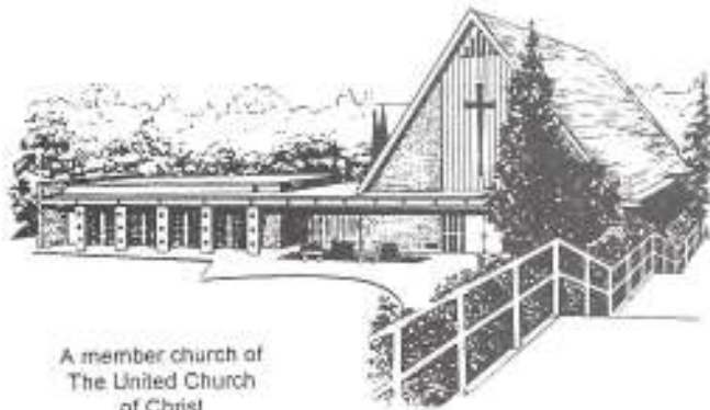
A member church of The United Church of Christ