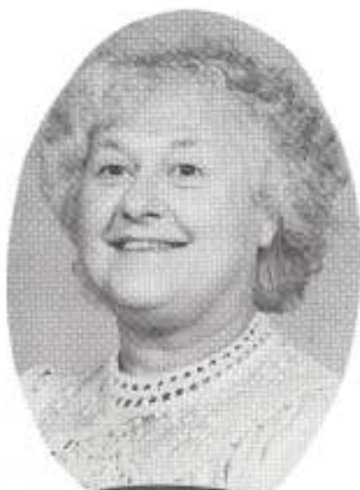
Veta Louise Simmons