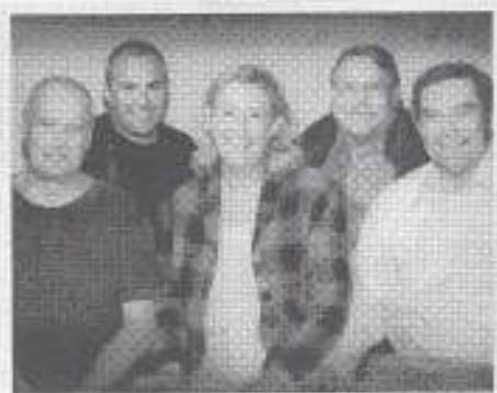
Stage Crew & Properties