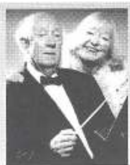
The Stowes 50+ years in theatre