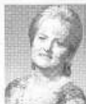
Hair & Make-up