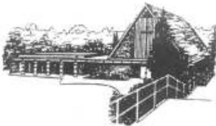
A member church of The United Church of Christ