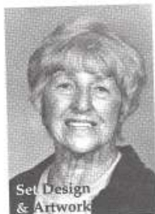
Set Design & Artwork