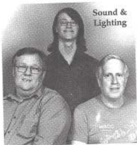
Sound & Lighting