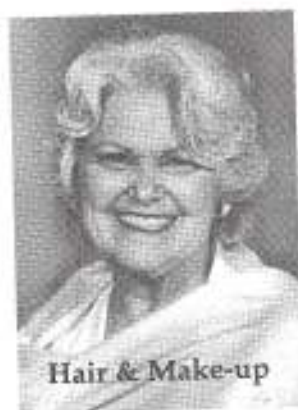
Hair & Make-up