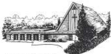
A member church of The United Church of Christ