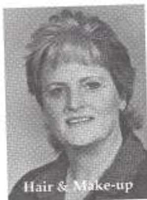
Hair & Make-up